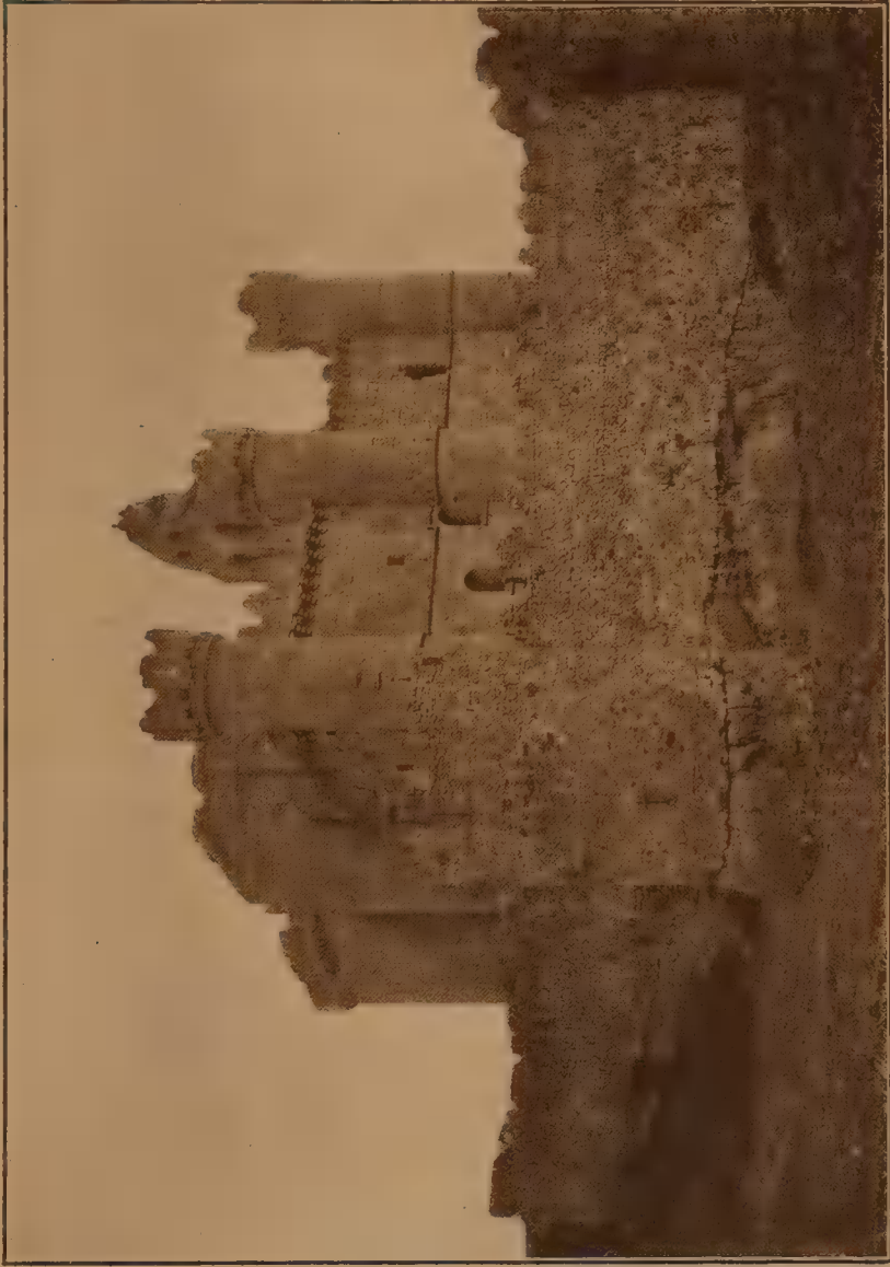
AN ANCIENT CASTLE